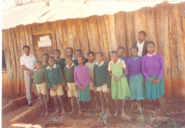
Late1980s and Early 1990s