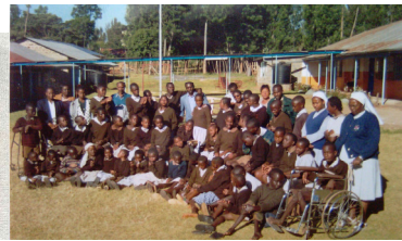
Late1990s and Early2000s